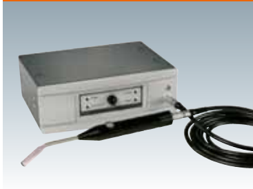
AP 55 Sniffer Probe

For automatic leak testing of entire products or parts of products. Can also be used for testing permeability of materials.