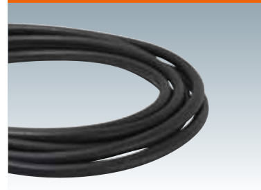
C 21 Probe Cables

Replaces the standard hand probe in automated tests.