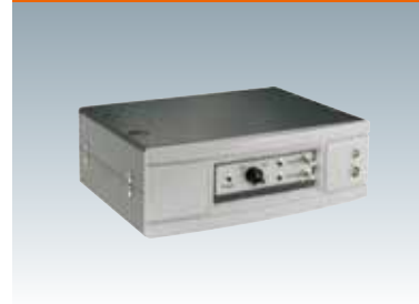
AP 57 Counter Flow Probe

For fast manual leak location in hard-to-reach places. Active probe that sniffs the sample air past the hydrogen sensor in the probe tip.