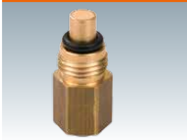
H 65 Insert Sensor

With a flexible neck. Facilitates leak detection in hard-to-reach places.