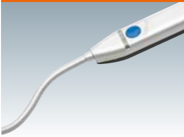
P 50 Flex Hand Probe

For leak detection in enclosed spaces or in environments with a high background level of tracer gas. An adjustable air flow from the probe tip provides a protective air curtain against tracer gas in the surroundings.