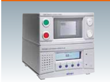
ILS 500 Leak Testing System

For controlled filling and evacuation of tracer gas in the test object. Controlled by the ASH 2000.