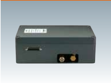
AP 29 Sampling Probe