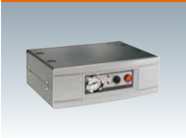
TGF 10 Tracer Gas Filler

In lengths of 3, 6 and 9 metres for comfortable leak detection in every situation.